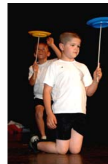
Cadbury heath inspired us all With their circus skills

As well as inclusion games of Boccia from the Patchway family (New Siblands pupils starring). Badminton from King Edmund and Culverhill. We saw speed, agility and quickness routines like never before, from the Breakfast Club at the Grange! Talks from Headteachers and others were an insight of just how much the programme has impacted on schools, pupils and staff!